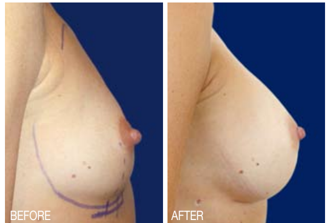
BEFORE : 26 year old patient with small breasts and no sagging